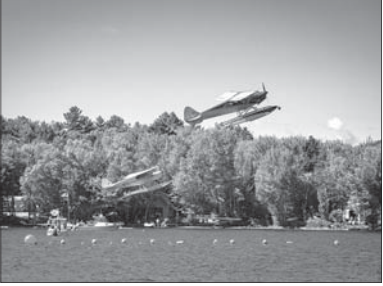
THE SKY'S THE LIMIT – Two aircraft take off at last year's International Seaplane Fly-In in Greenville, (Angela Arno photo)

For more information, the complete event schedule and updates, visit www.seaplanefly-in.org.